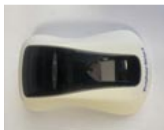
FIGURE 3: Bluephase Meter II for light irradiance monitoring.

LCUs must be maintained to maximise performance. It is recommended to check the irradiance of your light at least every six months. A simple device