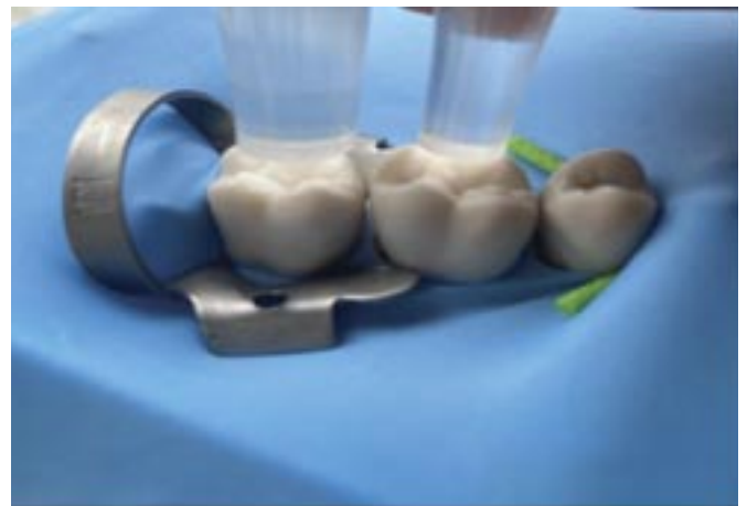
FIGURE 1: The diameter of the light tip needs to be taken into account, particularly when curing a wide mesio-occlusal-distal (MOD) cavity with a bulkfill composite.