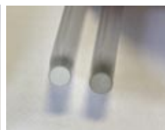
FIGURE 4: Comparison of an old and new light tip.