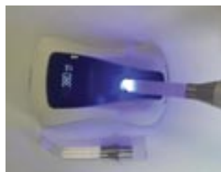
FIGURE 5: Radiometer readings from the same light curing unit, but comparing the old and new tips illustrated in Figure 4. Significant drop in output can be seen.

from Ivoclar Vivadent called the Bluephase Meter II is readily available and considered sufficient (Figure 3).